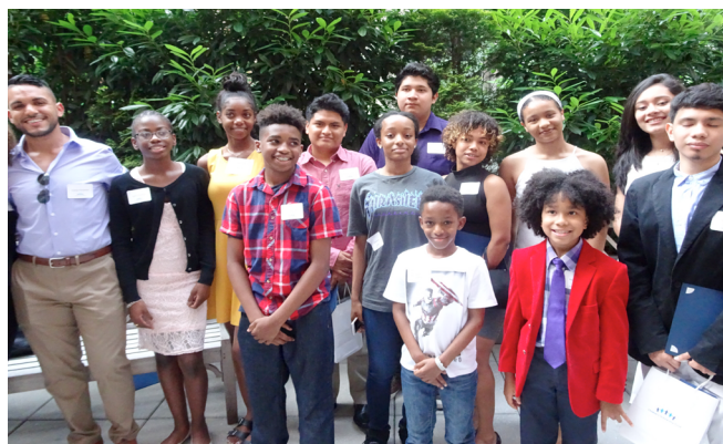
Current and former CSF Scholars enjoyed networking with each other at CSF's Celebrate Success event this June.