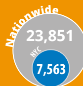
Number of CSF Scholars in 2016-17 school year

Based on past surveys of CSF alumni, we are confident this year's eighth graders have an excellent chance of graduating from high school and going on to college. For example, last year we found that 95 percent of CSF alumni in New York graduated high school on time , compared to the average New York City public school graduation rate of 72.6 percent. Congratulations, graduates!