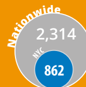
Number of CSF Scholars graduating from 8th grade in 2017