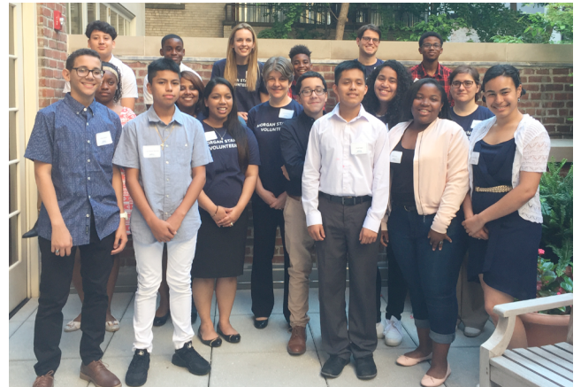
CSF Scholars who recently graduated from eighth grade joined Morgan Stanley volunteers for a financial literacy/resume workshop in June.