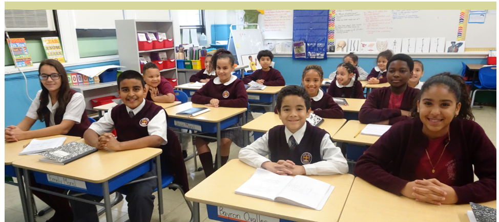
CSF Scholars at Sacred Heart School in the Bronx are ready and excited to learn! These bright and cheery faces represent the almost 24,000 children using CSF scholarships nationwide this school year.

Almost 24,000 children across the country began the new school year using scholarships jointly funded by CSF and the CSF partner programs. And since 1998, CSF and its 23 partners nationwide have awarded $695 million in scholarships to 158,000 children, allowing their families to choose the schools that best meet their needs.