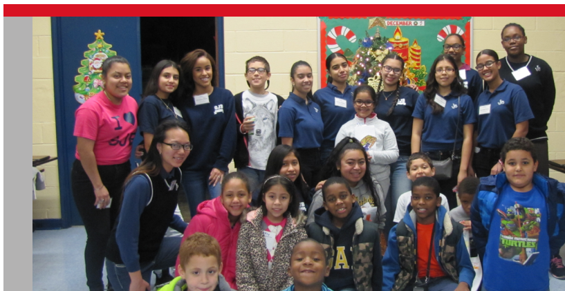
CSF alumni from St. Jean Baptiste High School volunteered at the LitFest event, helping current CSF Scholars with bookmark-making and other activities encouraging literacy.

We are very grateful to CSF Young Leaders and CSF alumni and staff at St. Jean Baptiste High School for volunteering; our hosts at Our Lady Queen of Angels School; our partners at LitWorld, and everyone else who made the event a success!