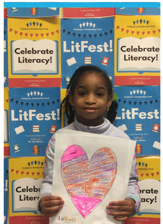
CSF Scholars at the LitFest event posed for photos after creating heart maps and designing superheroes, and everyone got to take home a book or two.