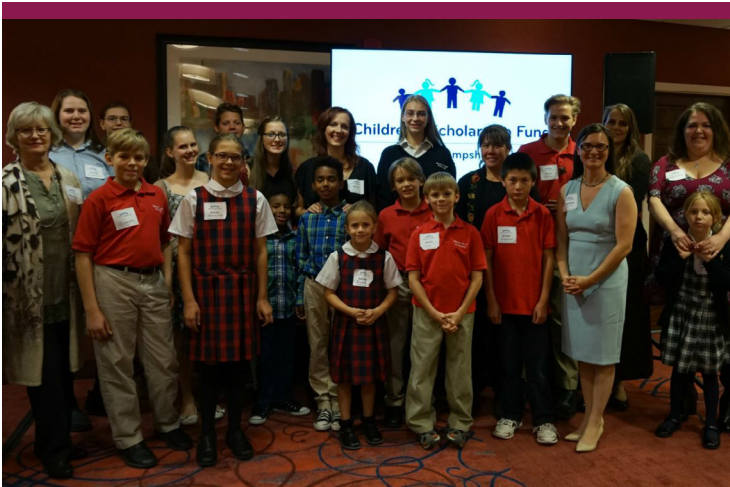
CSF Scholars, families, and supporters gathered at the "Celebrate Success" event at the Falls Event Center in Manchester this fall.