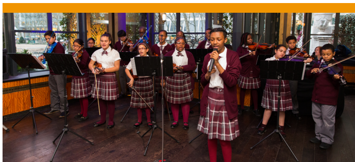
Guests were welcomed with musical performances from the choir and violin ensemble of East Harlem's Mt. Carmel-Holy Rosary School.

CSF is extremely grateful to our honorees, sponsors, and all our guests. All proceeds from the event will support CSF scholarships in New York City.