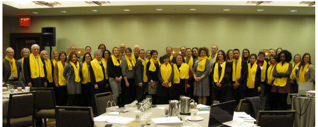
CSF partners, staff, and guest speakers posed for a group picture at the CSF Partner Summit in Jersey City.

Executive directors from CSF partner programs nationwide gathered in Jersey City, NJ, earlier this year to share ideas and best practices that will strengthen our scholarship programs as we build for the future.