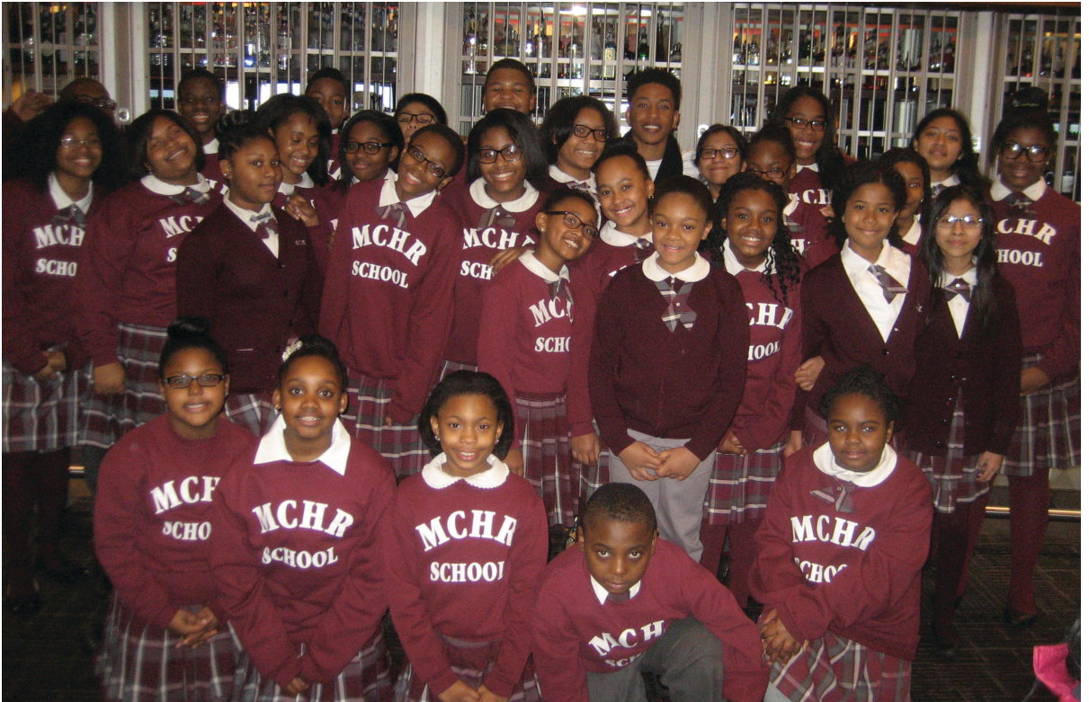
This December, CSF Scholars met singer Jacob Latimore (and Santa!) at a pre-holiday breakfast at Madison Square Garden hosted by our friends at Sequential Brands Group!