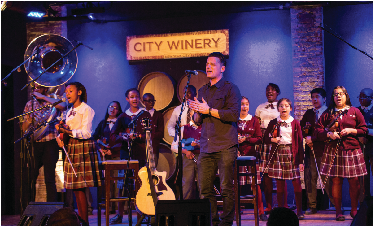
O.A.R. lead singer Marc Roberge was honored at CSF's Champions for Children event in March, and he performed along with the choir and violin ensemble from Mt. Carmel-Holy Rosary School in East Harlem.