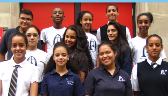
Eighth grade CSF Scholars at Ascension School in Manhattan.

Based on past studies of CSF alumni, we can confidently predict this year's eighth graders have an excellent chance of graduating from high school and going on to college. For example, last year we found that 92 percent of CSF alumni in New York graduated high school on time, compared to the average New York City public school graduation rate of 64.2 percent. In addition, 90 percent of the graduating alumni enrolled in college. That's news worth celebrating!