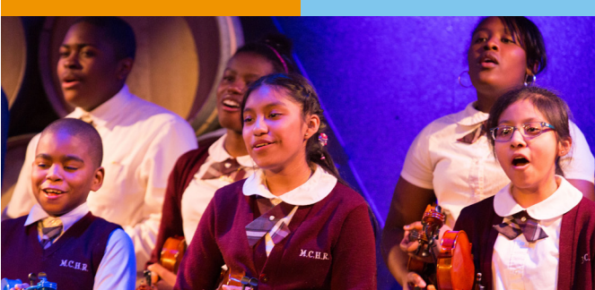
The choir and violin ensemble from Mt. Carmel-Holy Rosary School were an incredible opening act, impressing guests with their talent and joyful energy.