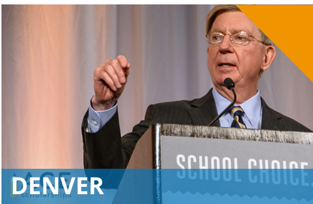
Washington Post columnist George Will headlined the 2015 ACE Scholarships Luncheon in Denver this April.