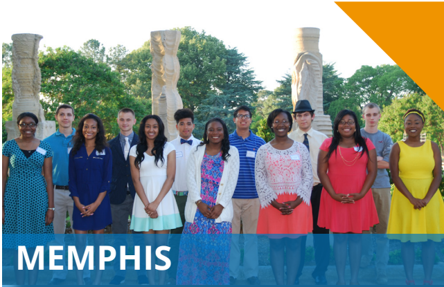
Memphis Opportunity Scholarship Trust (MOST) recently honored MOST Scholars who are graduating from high school this spring.