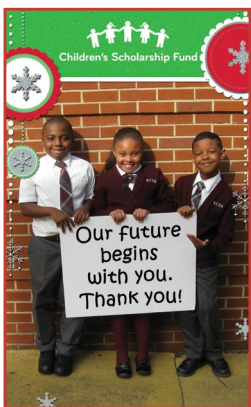
CSF tribute cards come in several attractive designs and are an excellent gift idea!

Copies are available for sale on Amazon.com at http://bit.ly/OppHopeAmazon .