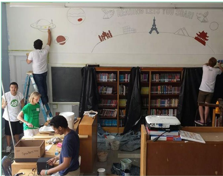
Volunteers from Trulia worked with CSF to repaint Ascension's library in July.