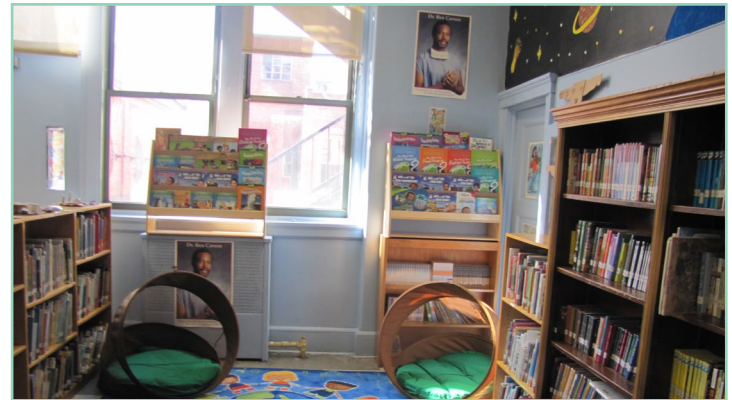
The new Ben Carson Reading Room at Ascension, where more than 80 CSF Scholars attend, is a welcoming place for students to develop their love of reading.