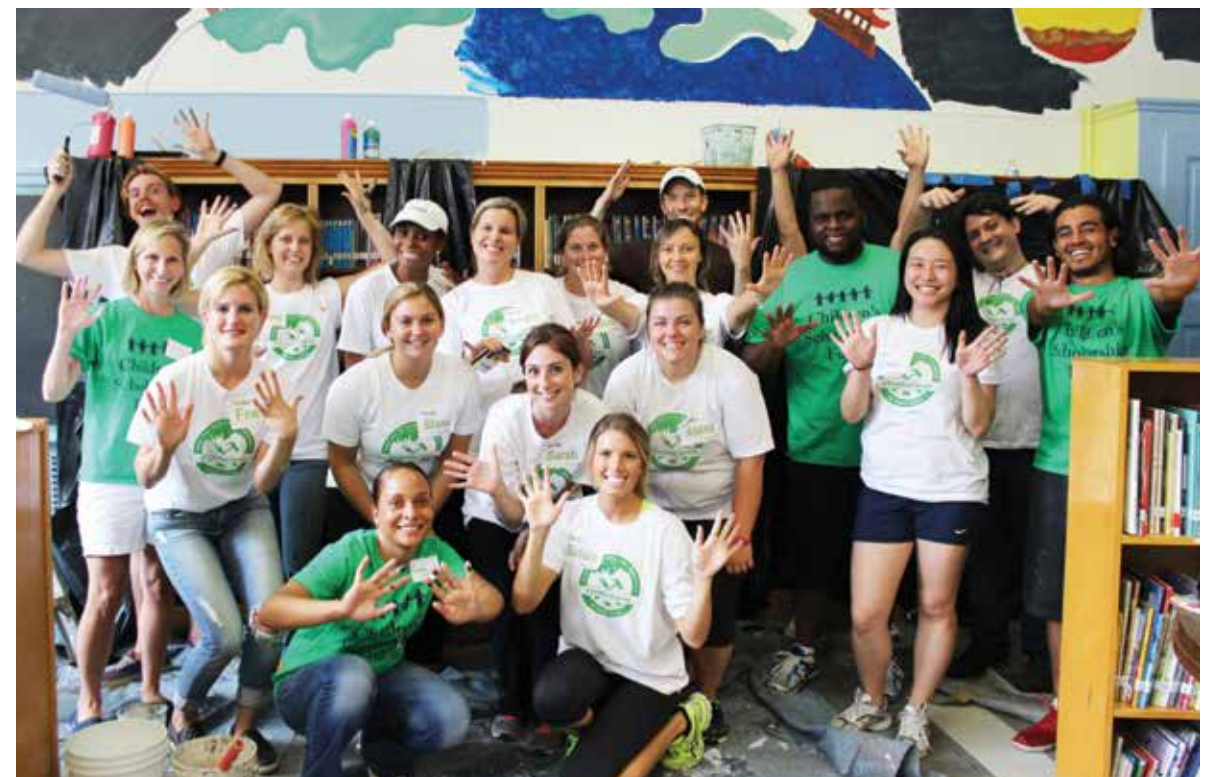
Trulia employees partnered with CSF to paint the library at Ascension School. Thank you, Trulia!