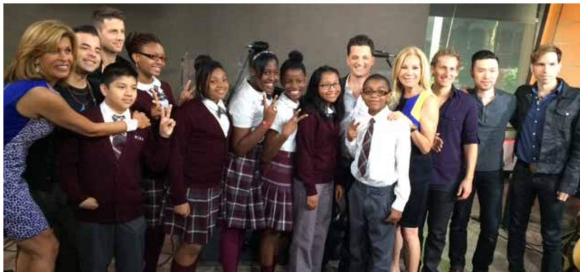
This June, a group of CSF Scholars performed with O.A.R. on NBC's TODAY Show. Thank you to O.A.R. for this opportunity.

Citi Bike Dropbox Jenex Graphics Juliska knot by TIFFA Moleskine® Moore Brothers Wine Company Sequential Brands Group Soundview Millworks The Winey Neighbor