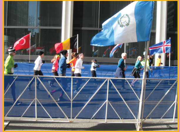
The scene in downtown Manhattan as CSF's Half-Marathon team approached the finish line.