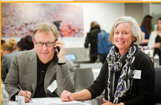
In April, CSF Philadelphia supporters gathered at the program's Annual Lottery Day Celebration and made calls to families letting them know they had been chosen to receive new scholarships for the upcoming school year.