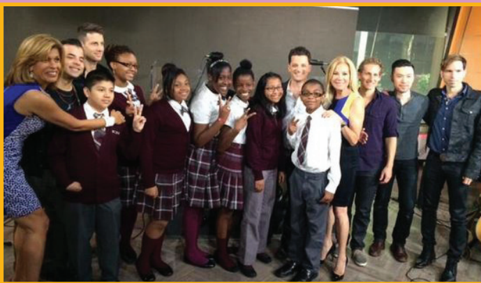
CSF Scholars from Mt. Carmel-Holy Rosary School posed with Hoda Kotb, Kathie Lee Gifford, and the members of O.A.R. after their TODAY Show performance.

Some lucky CSF Scholars from Mt. Carmel-Holy Rosary School in East Harlem recently sang on NBC's TODAY Show with O.A.R. as the band performed their new hit, "Peace" ( http://on.today.com/i1PCwo6 ).