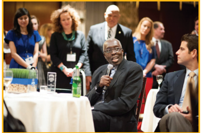
NBA Hall of Famer and former New York Knick Earl “The Pearl” Monroe addressed the attendees after receiving his Champions for Children Award.

Thank you to our honorees, the Trey Whitfield School choir, all who donated items for our live and silent auctions, Egel Sports Promotions, and everyone who supported the event and made it such a success. And a special thank you to our event sponsors: The Speedwell Foundation, Hill+Knowlton Strategies, and Sequential Brands Group. ●