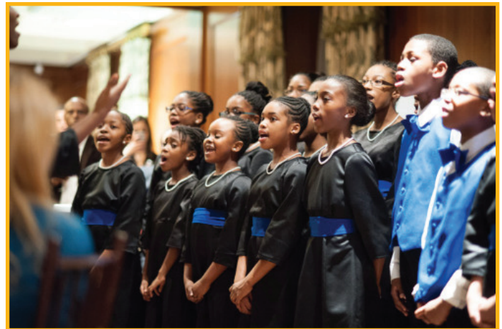
The choir from Trey Whitfield School in Brooklyn (a great academic environment for several CSF Scholars) performed “Over the Rainbow” and “Just the Way You Are.”