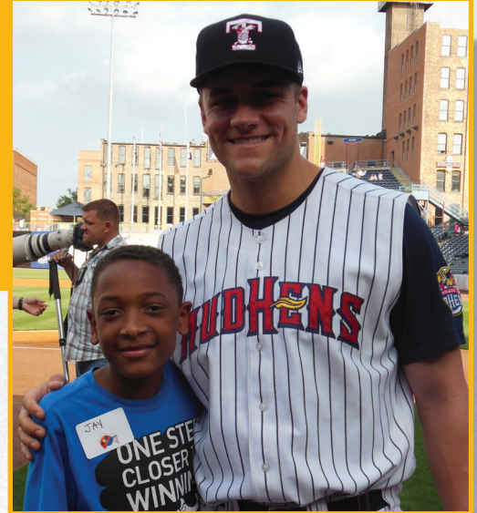
CSF's Toledo partner program, Northwest Ohio Scholarship Fund, recently hosted its second Raise the Cap fundraiser, bringing supporters and scholarship families out to Fifth Third Field for a Toledo Mud Hens game.