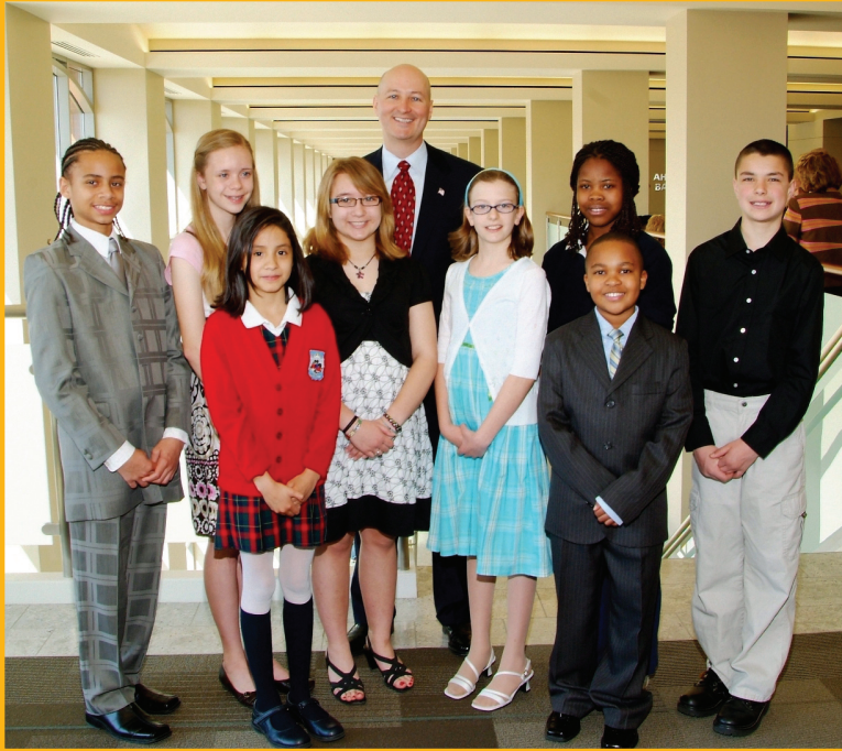
CSF of Omaha recently held an awards luncheon honoring scholarship recipients who have shown leadership and spirit in overcoming obstacles. This year's honorees are pictured here with CSF of Omaha Chairman J. Peter Ricketts.