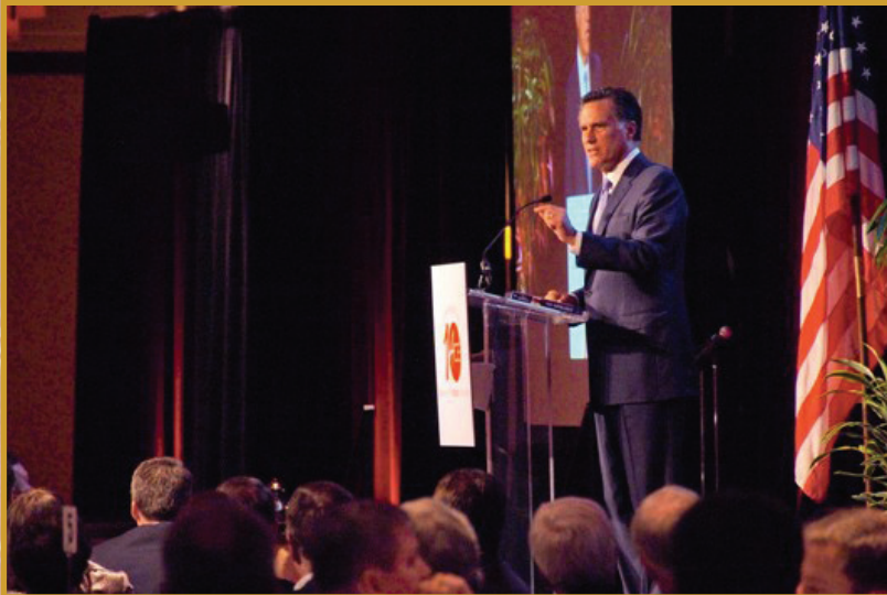
Former Massachusetts Governor and presidential candidate Mitt Romney addressed a crowd of more than a thousand people at a recent ACE Scholarships luncheon in Denver. This school year our CSF partner ACE Scholarships is funding scholarships for more than 600 Denver children.