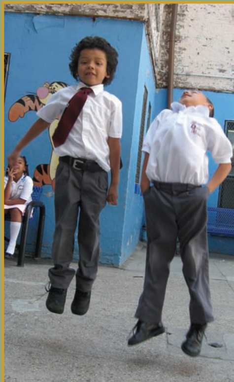
CSF Scholars at Guardian Angel School in Manhattan showing their best Superman take-off. ●

to choose their students. For low-income families, the only impediment