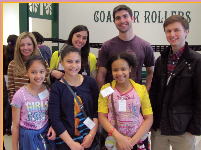
CSF Young Leaders and CSF Scholars on a recent field trip to Manhattan's Museum of Mathematics.