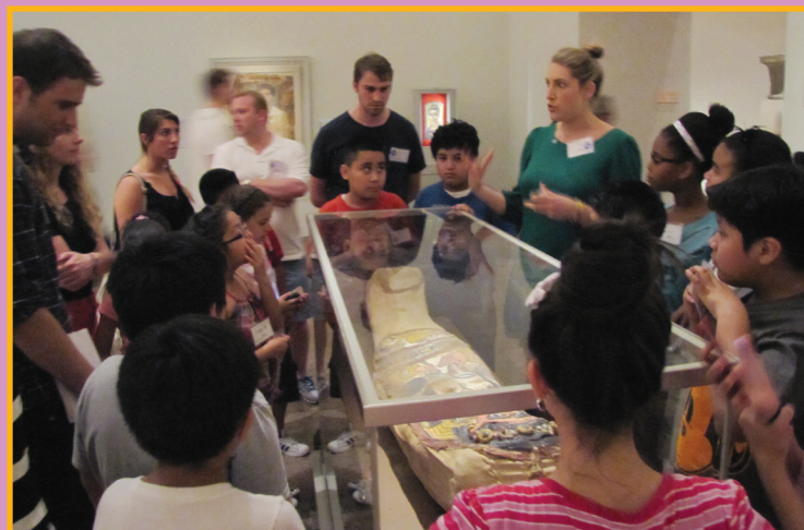
The second Young Leaders field trip took in the Met's Egyptian wing, where the children saw some mummies!