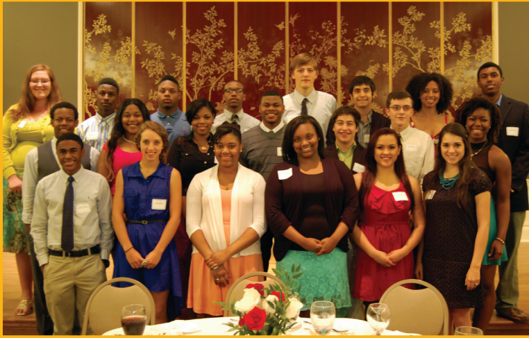
This May, CSF partner Memphis Opportunity Scholarship Trust hosted a reception celebrating its class of graduating high school seniors.