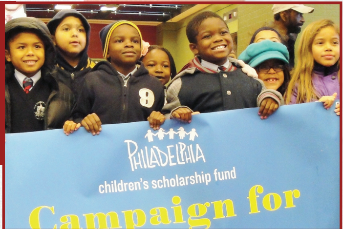
CSF Philadelphia Scholars were on hand to help spread the word at the Annual New Application Kick-off Event at Citizens Bank Park.