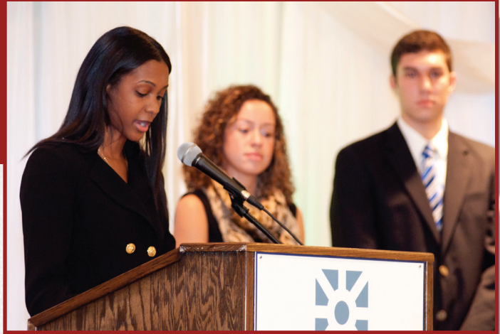
A BISON Fund alum spoke about how her scholarship has changed her life at the annual BISON Celebration Luncheon this October.