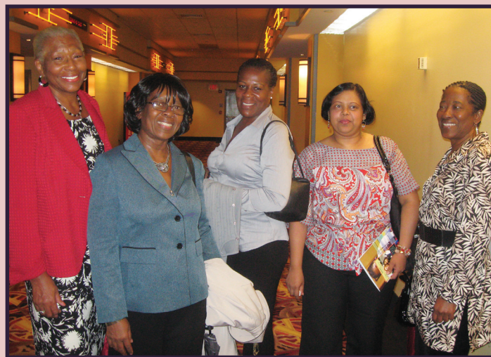
Administrators and faculty from Trey Whitfield School in Brooklyn (where several CSF Scholars are enrolled) came out to support CSF at the screening.