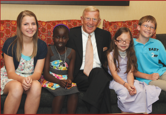
Former Notre Dame football coach Dr. Lou Holtz was the guest of honor at CSF Omaha's luncheon this June, which also honored six outstanding CSF Omaha Scholars.