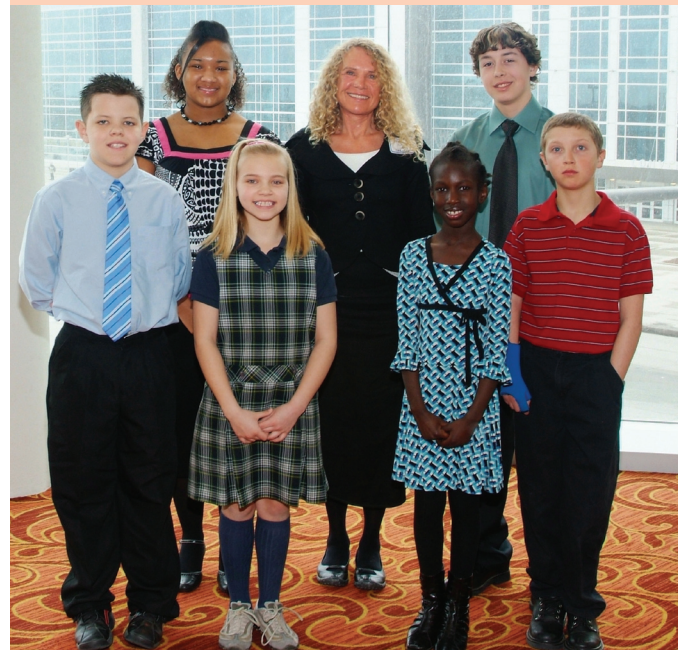
Christy Walton, wife of founder John Walton, with CSF scholarship recipients in Omaha.

The Children's Scholarship Fund aims to maximize educational opportunity for children at all income levels by offering tuition assistance in grades K-8 for needy families.